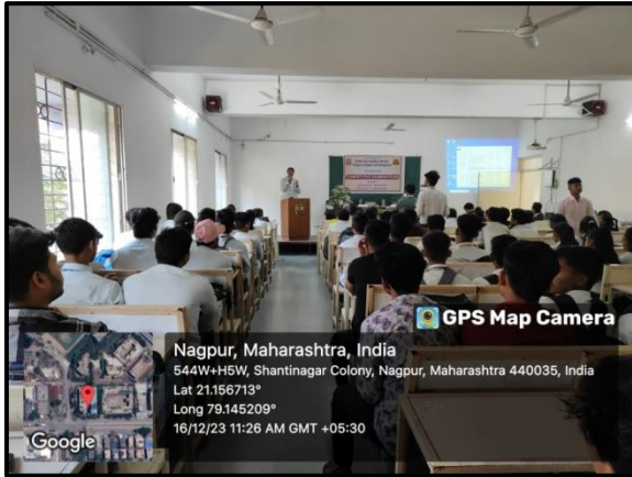
GPS Map Camera Nagpur, Maharashtra, India 544W+HSW, Shantinagar Colony, Nagpur, Maharashtra 440035, India Lat 21.156719° Long 79.145209° 16/12/23 11:26 AM GMT +05:30