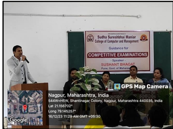
GPS Map Camera Nagpur, Maharashtra, India 544W+HSW, Shantinagar Colony, Nagpur, Maharashtra 440035, India Lat 21.156702° Long 79.145257° 16/12/23 11:29 AM GMT +05:30